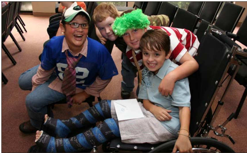
A scene from a recent worship service