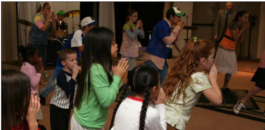
Sunday school children praise and worship before their classes.