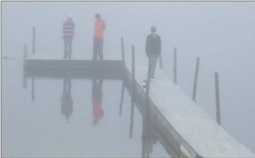
POA students at this year's Connect retreat ...