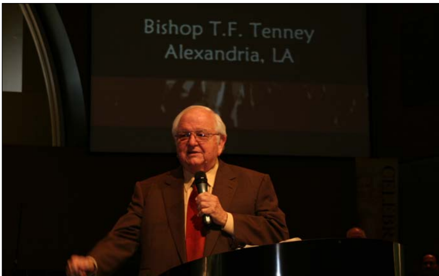
Bishop T.F. Tenney preached a prophetic word to our church body last Sunday night, encouraging us to seek to become an "epicenter" church.