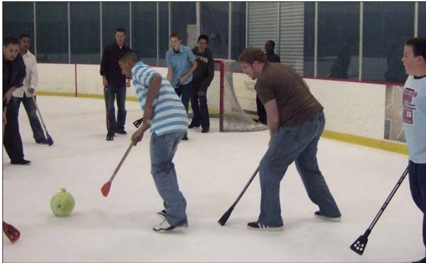
"Broomstick ball" at the RDV after Fusion